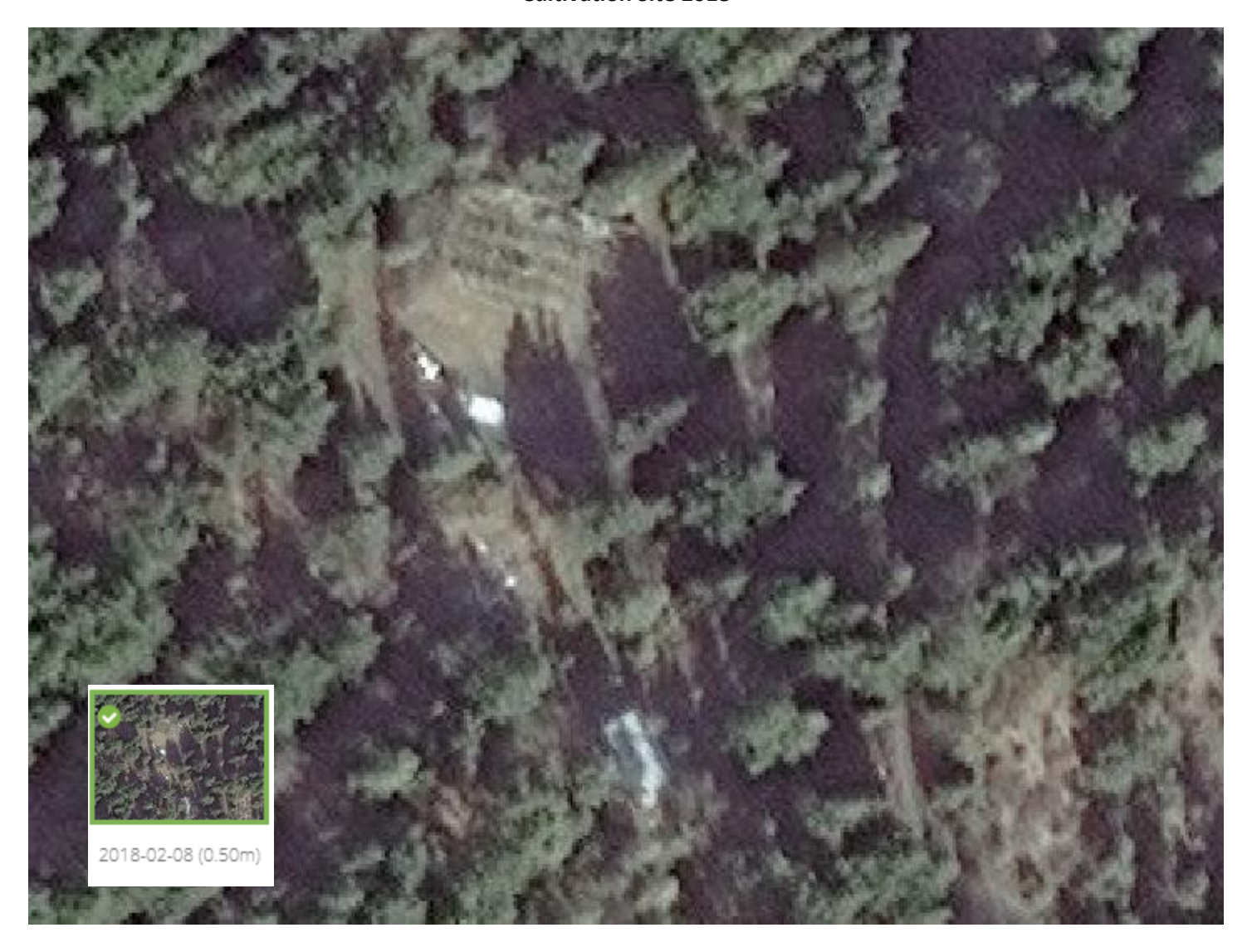
February 8, 2018