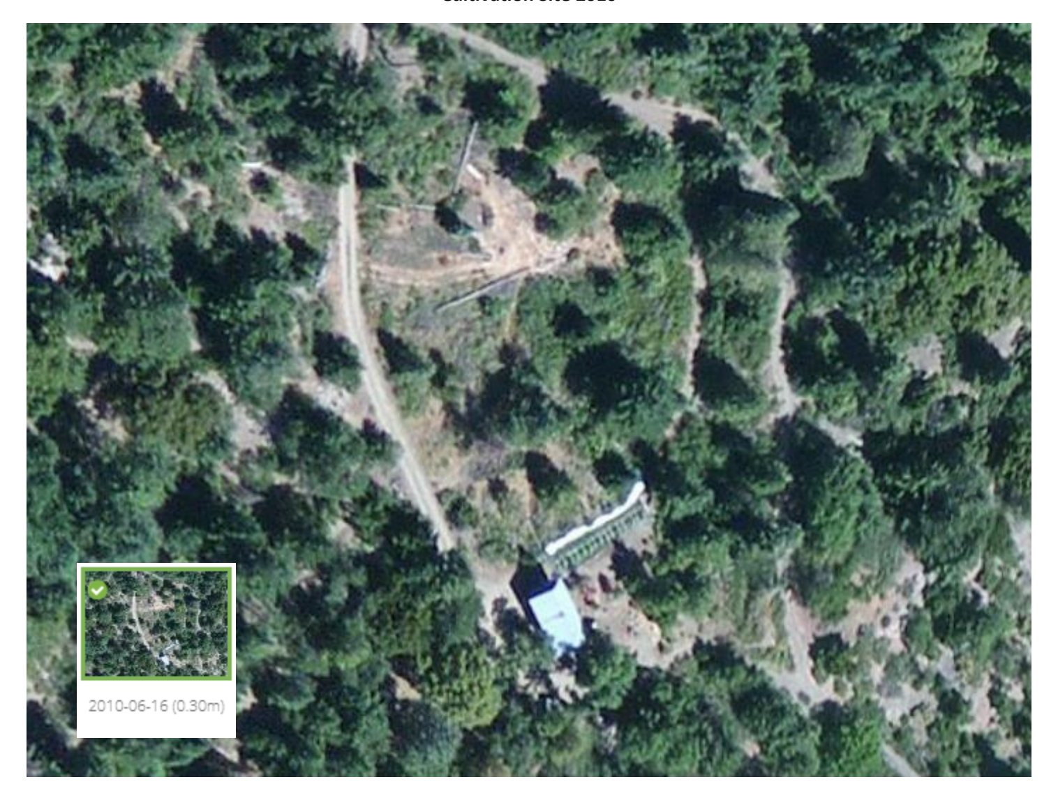
June 16, 2010