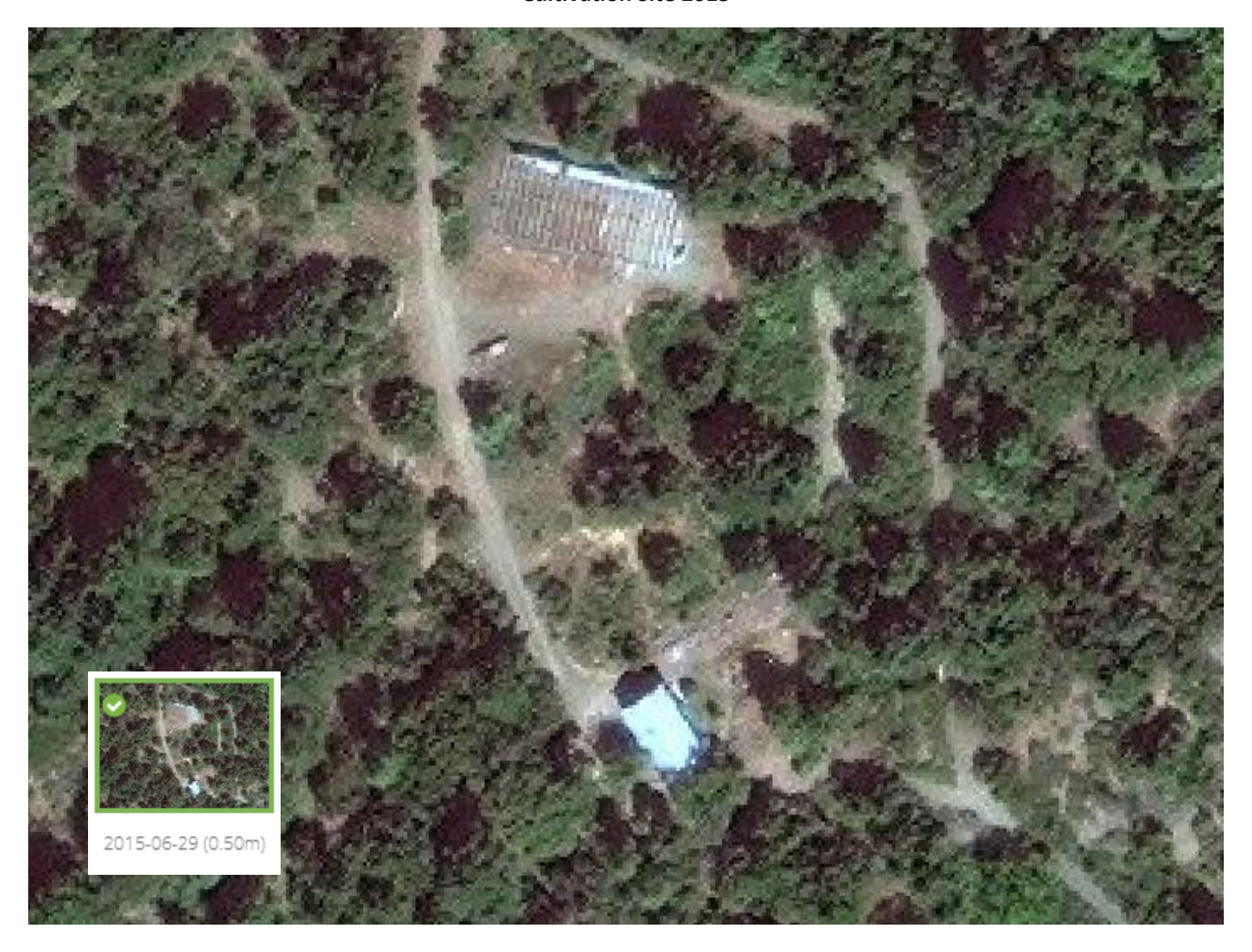
June 29, 2015