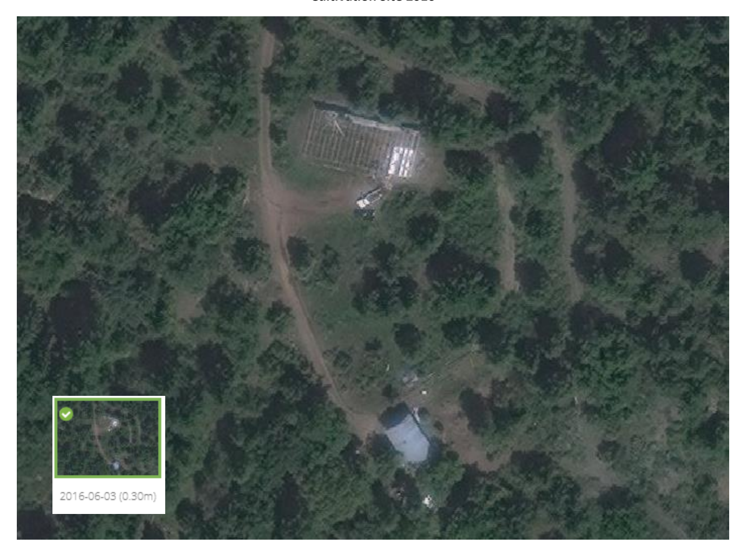
June 3, 2016