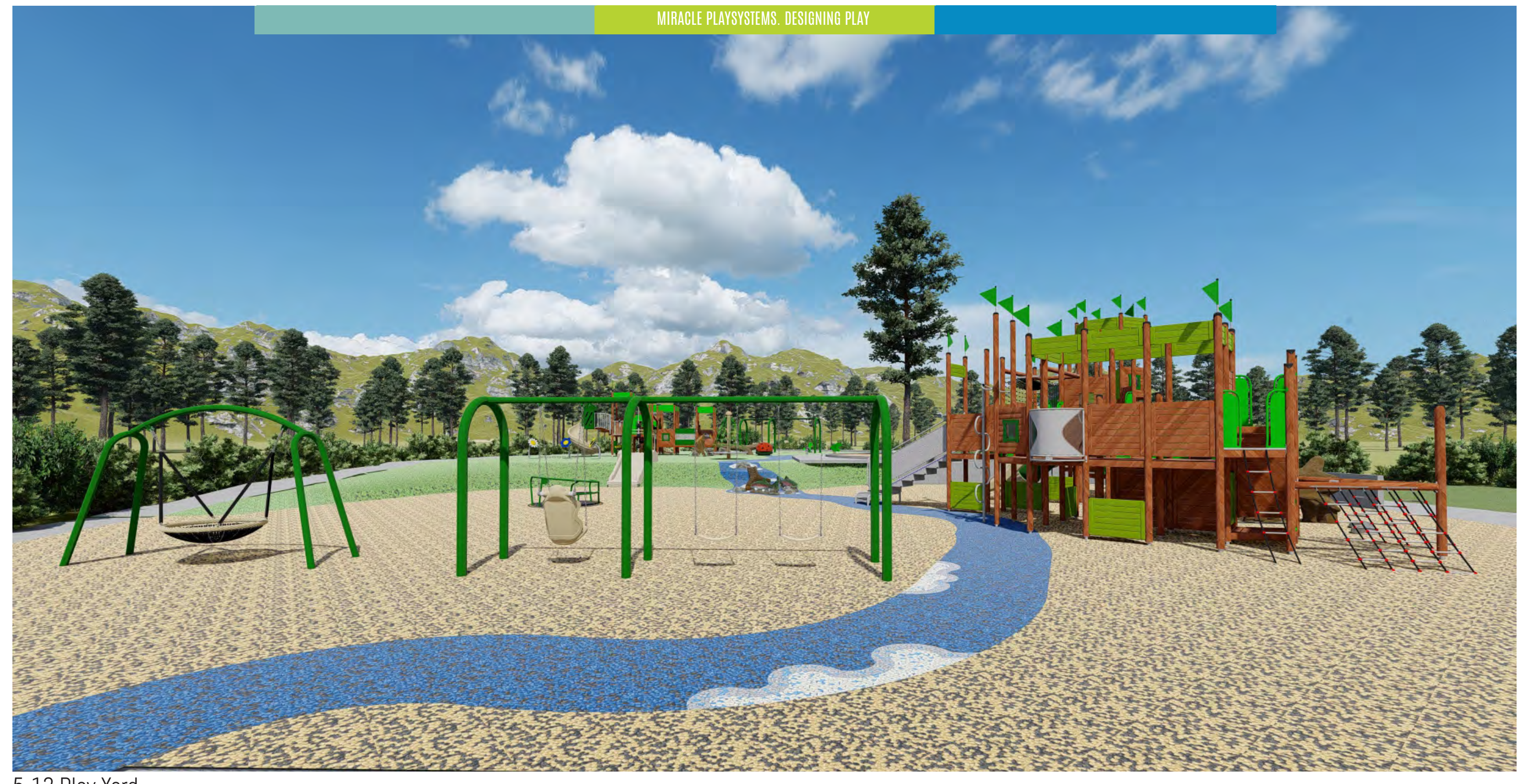
5-12 Play Yard