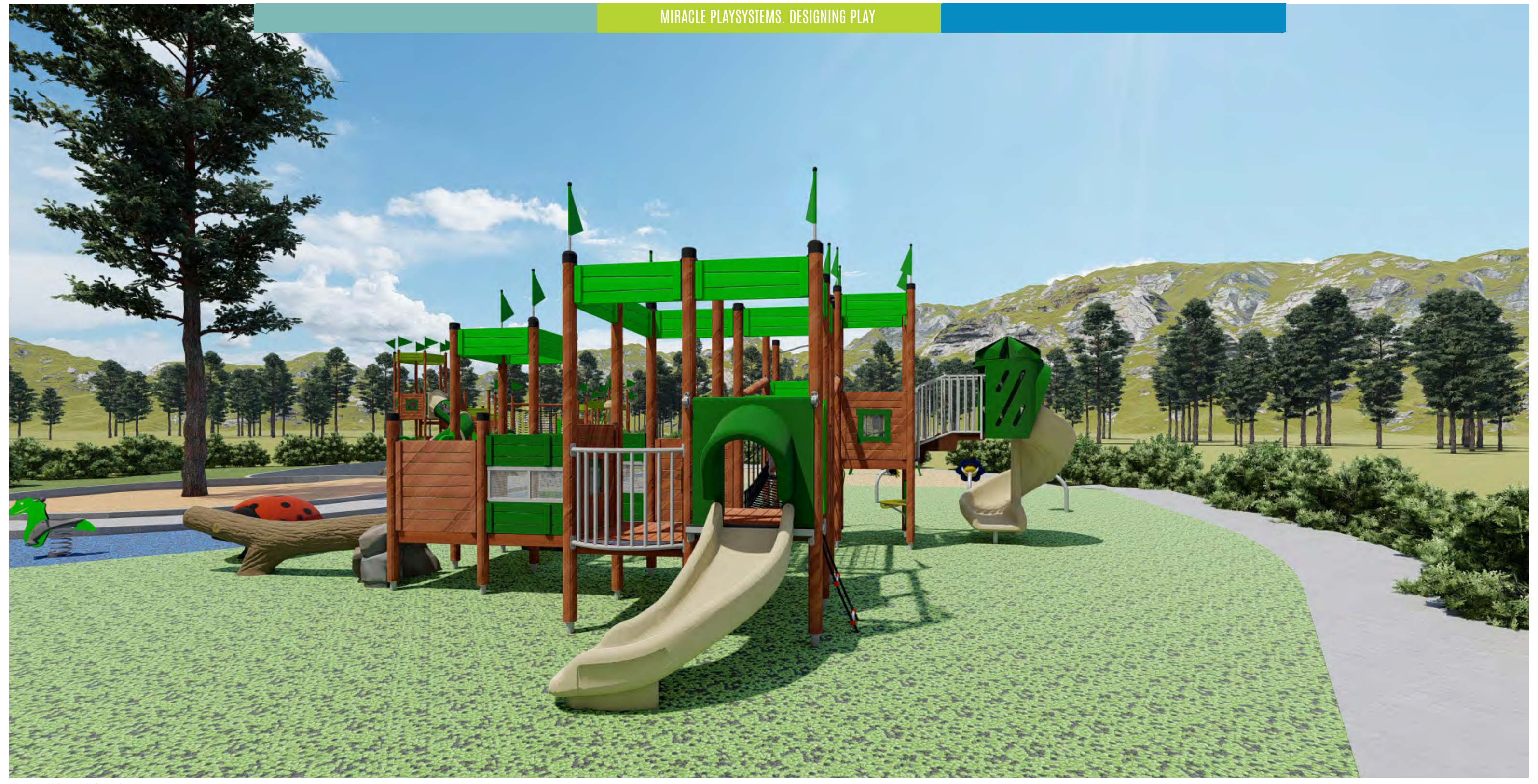
2-5 Play Yard