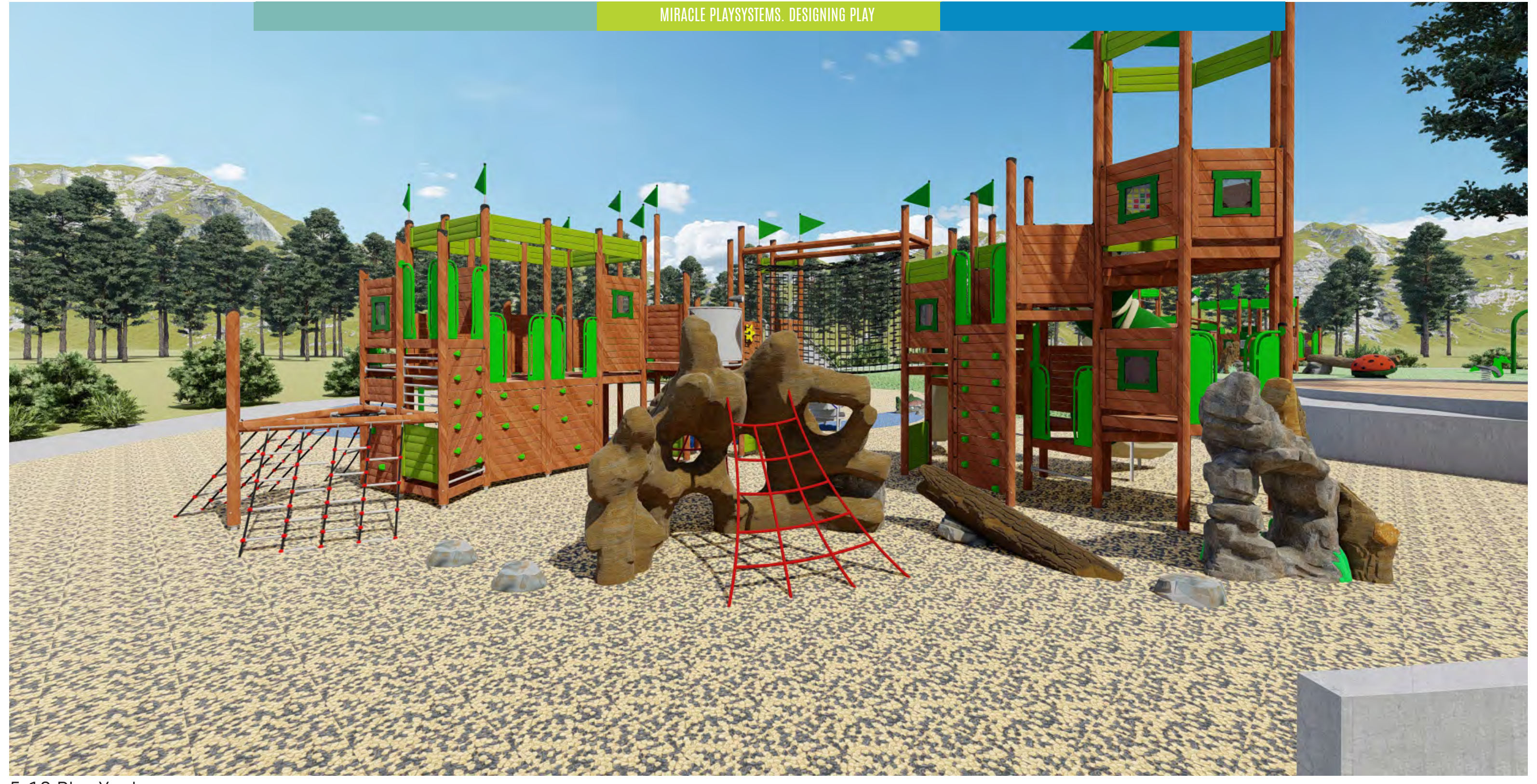
5-12 Play Yard