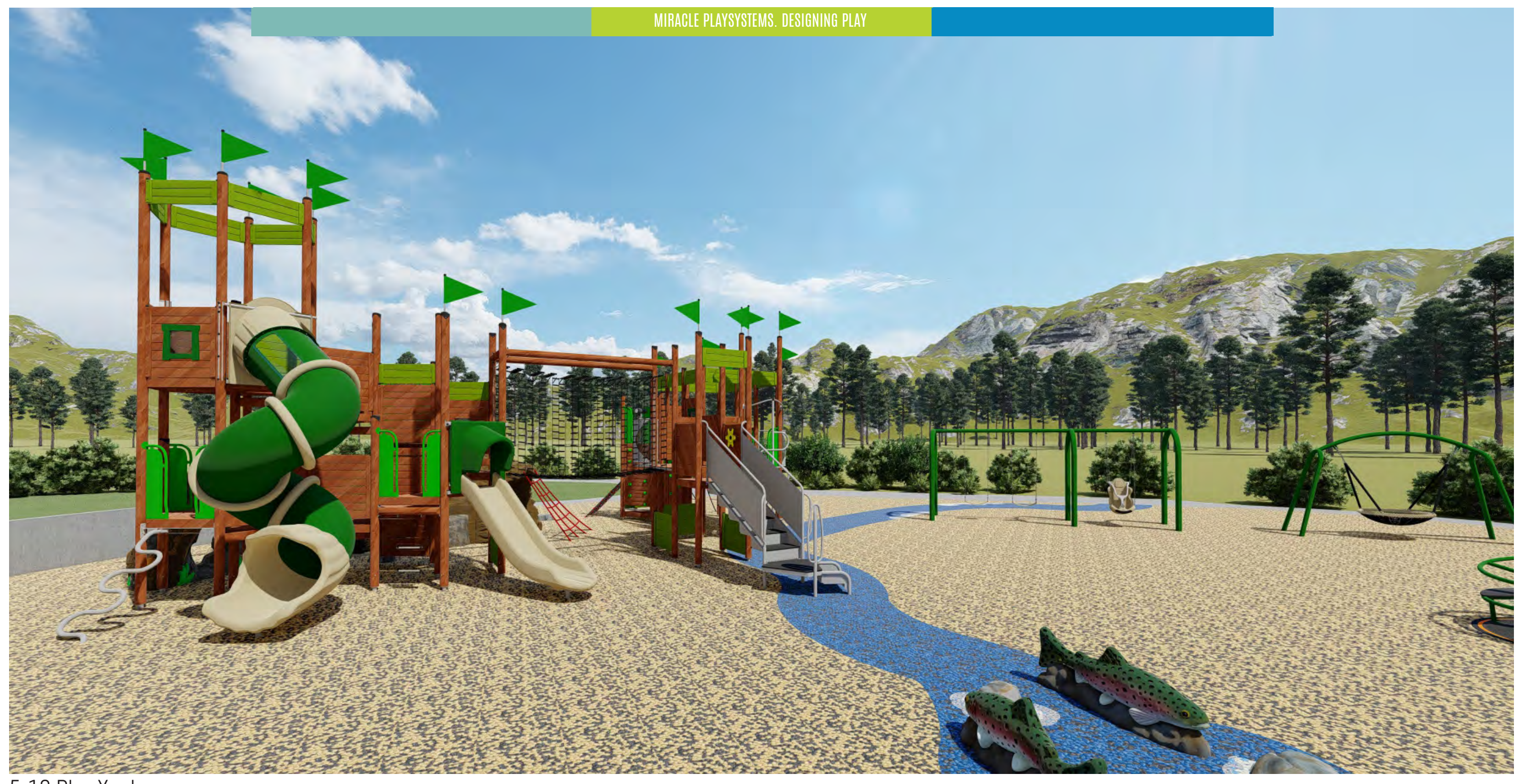
5-12 Play Yard