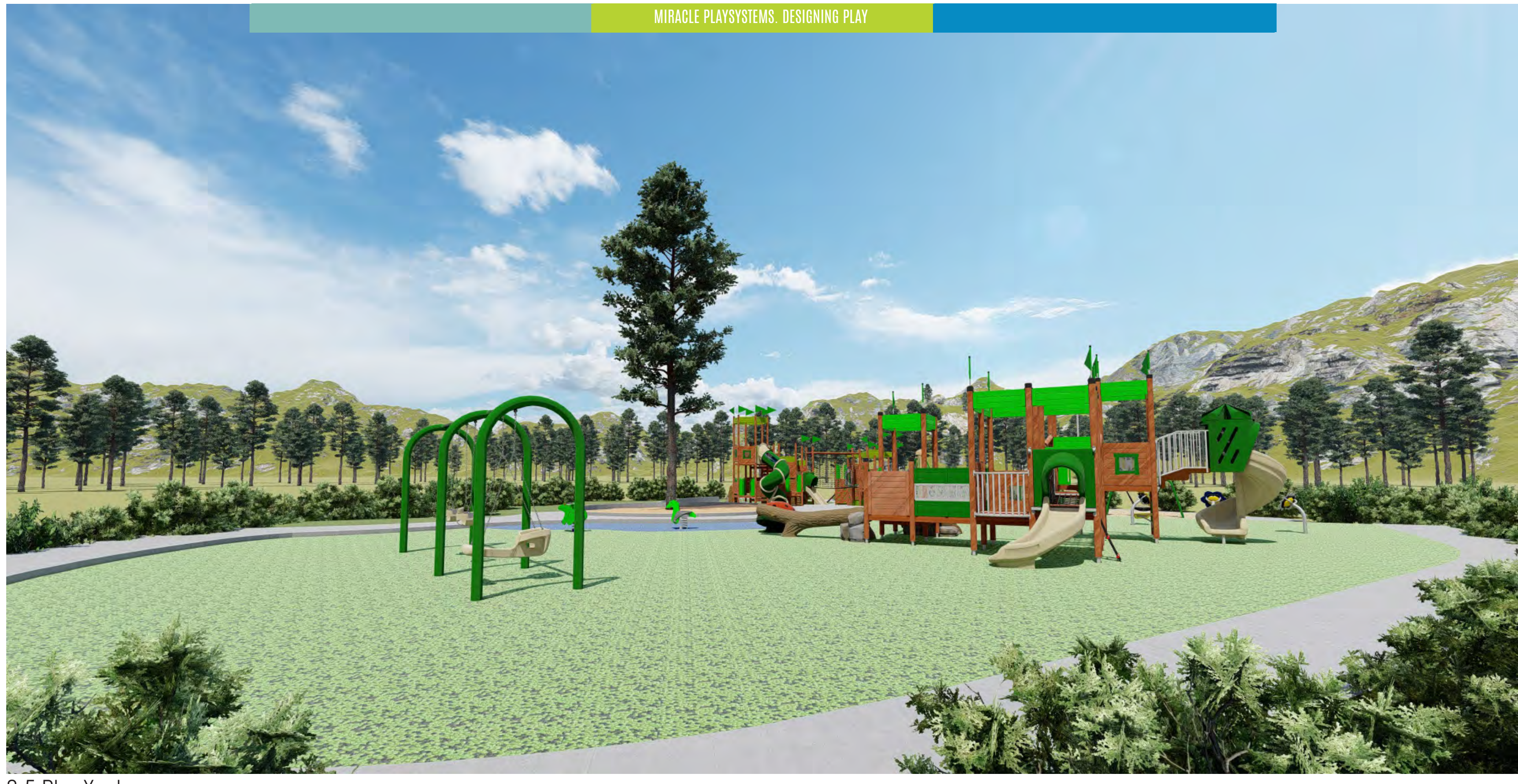
2-5 Play Yard