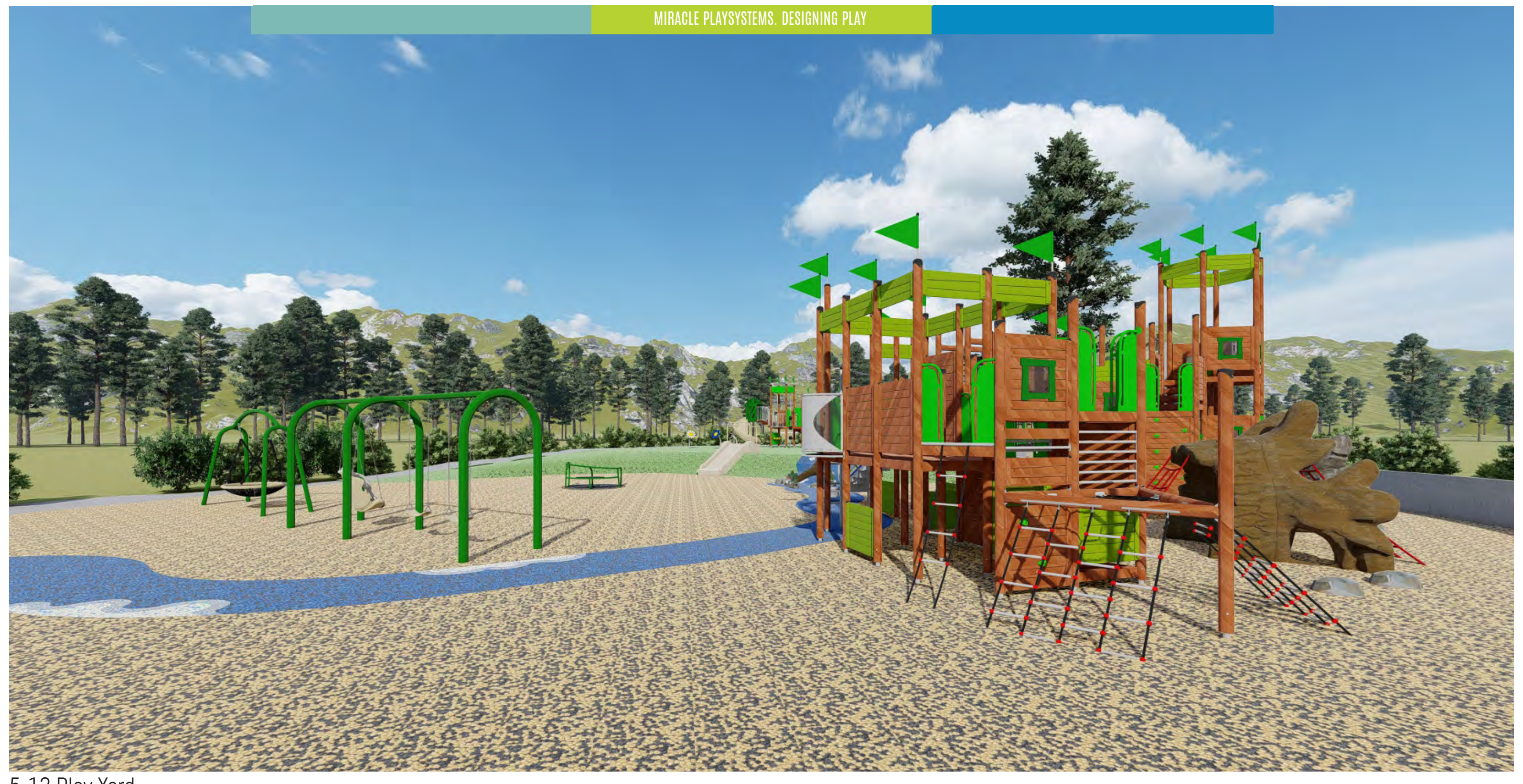
5-12 Play Yard