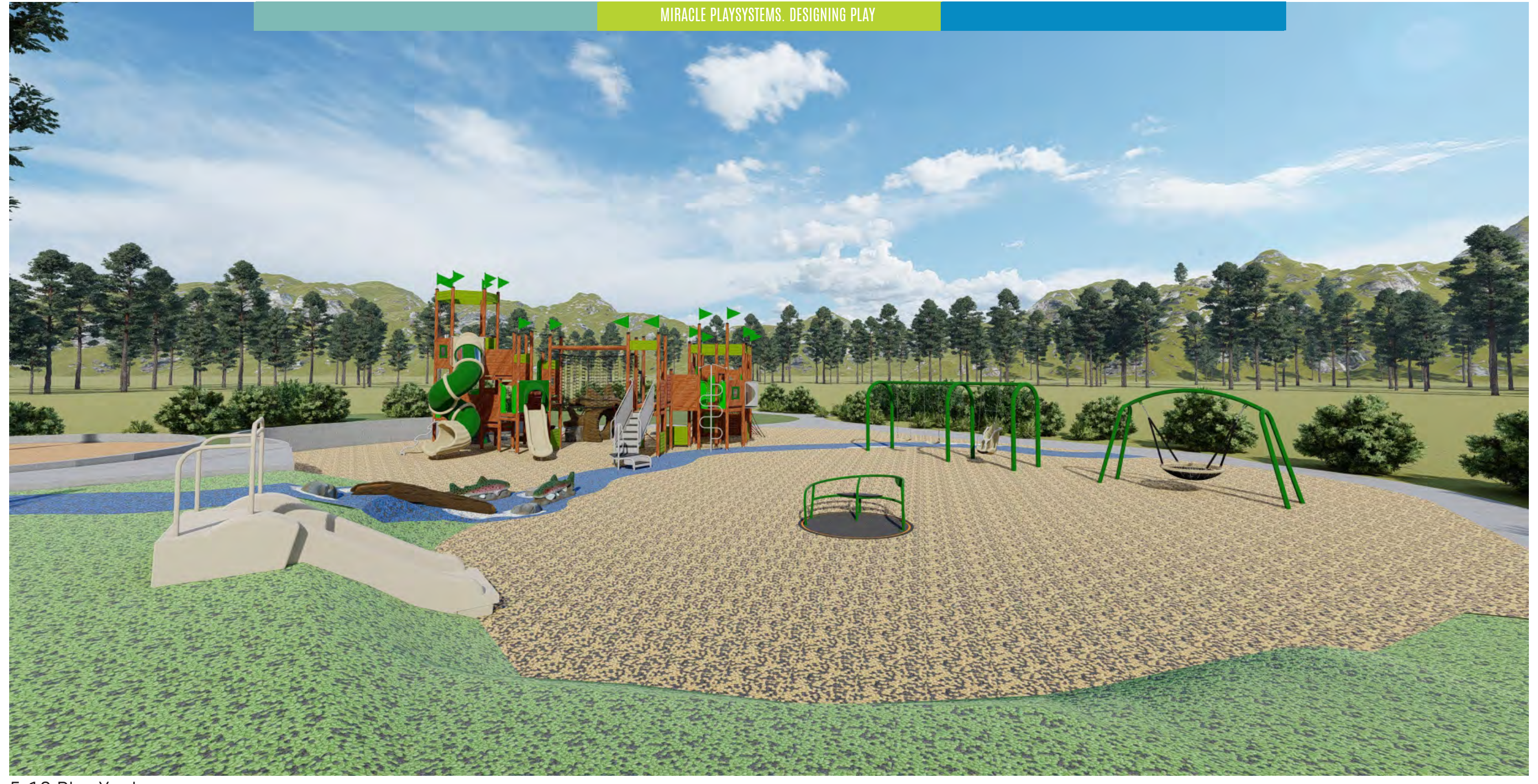
5-12 Play Yard