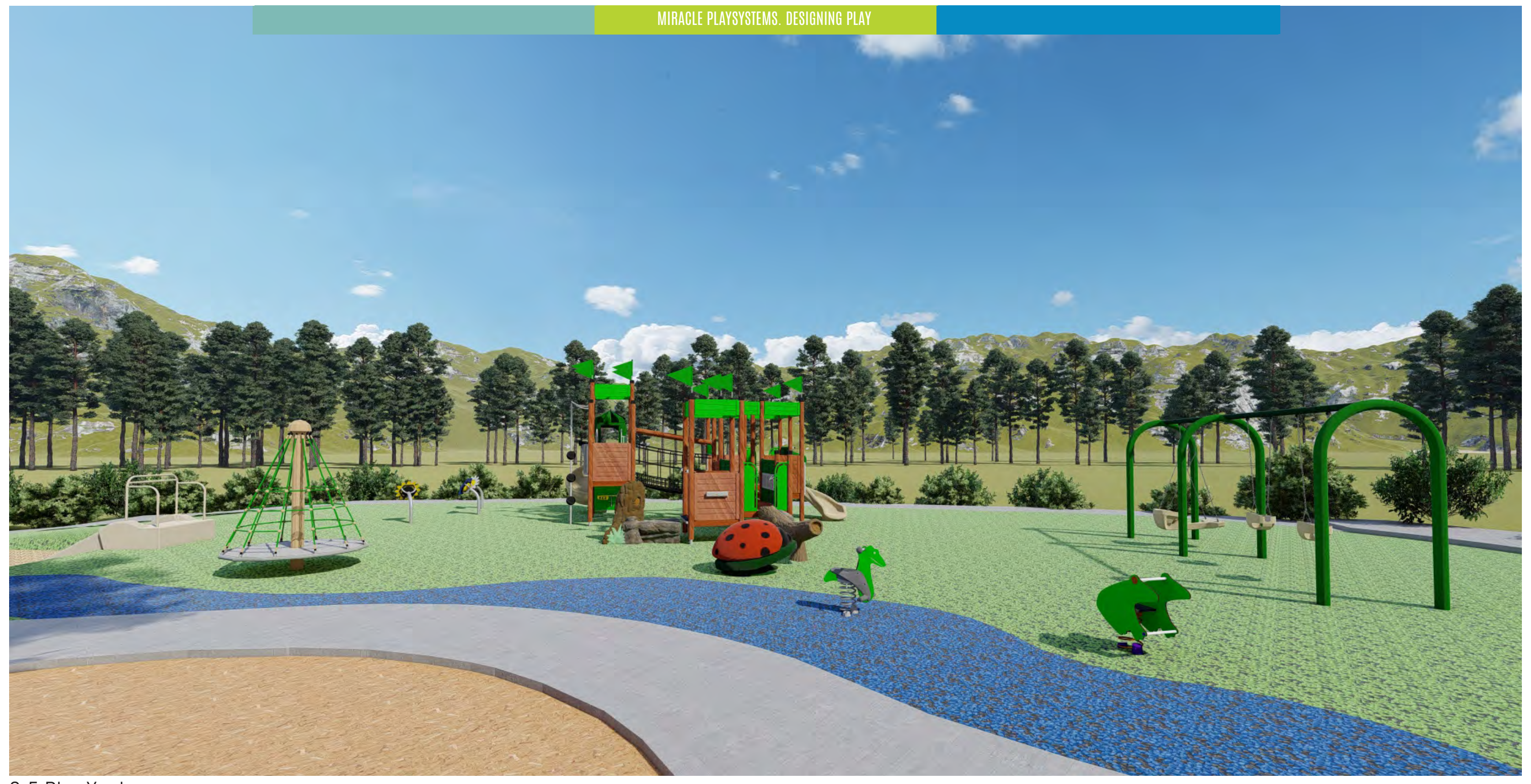
2-5 Play Yard