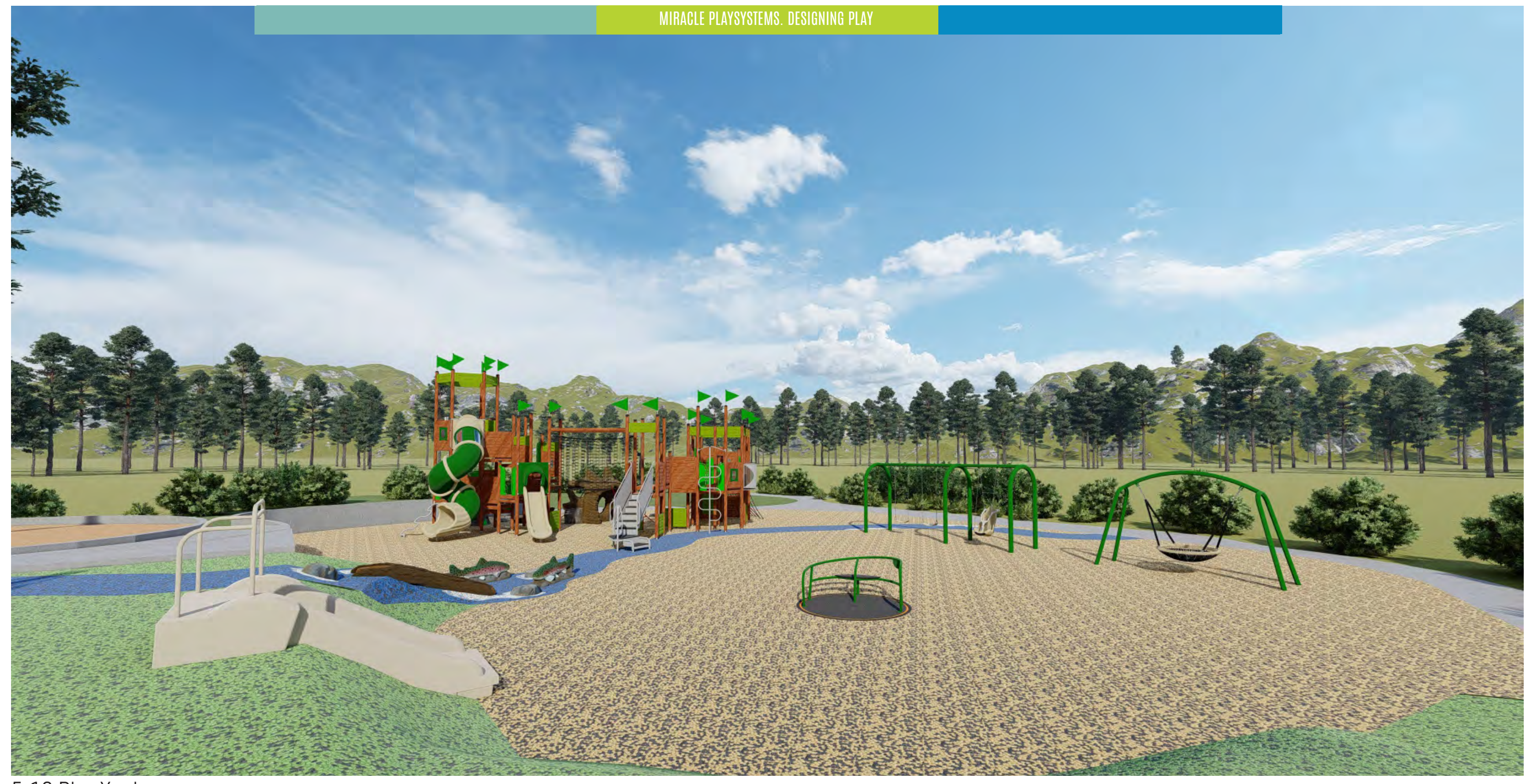
5-12 Play Yard

*Colors shown in rendering are for illustrative purposes only. Actual color and pattern may vary slightly.