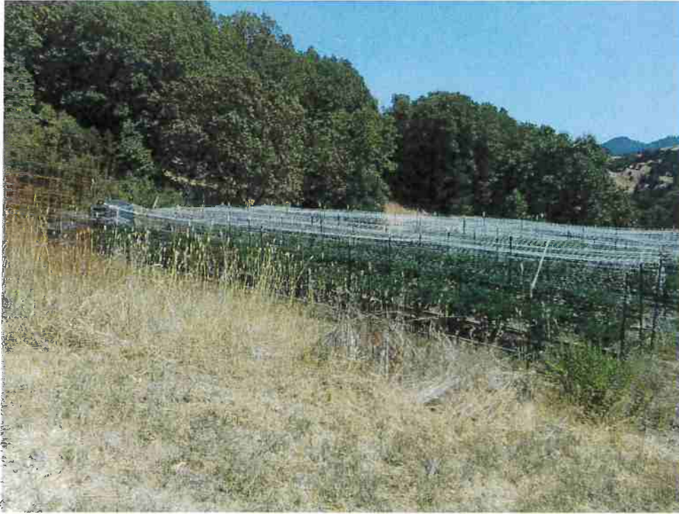
Cultivation Area F – to be removed out of riparian setbacks and restored entirely