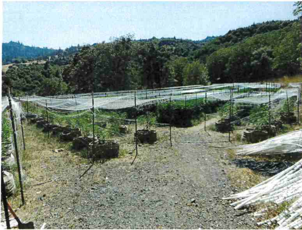
Cultivation Area G – to be altered out of 50' riparian setback