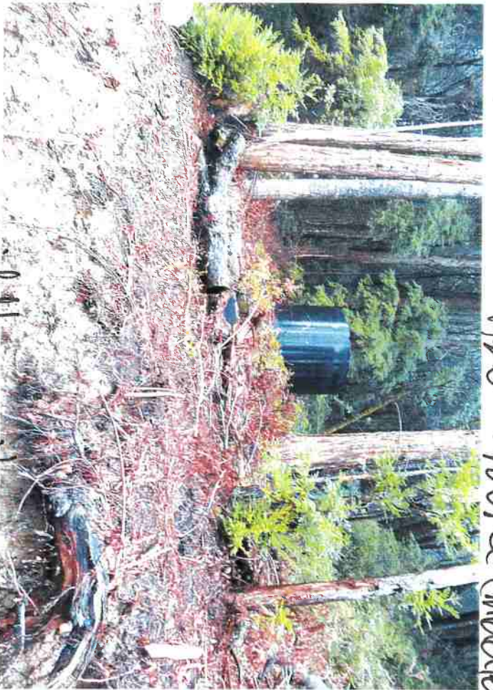
HyD source (middle)