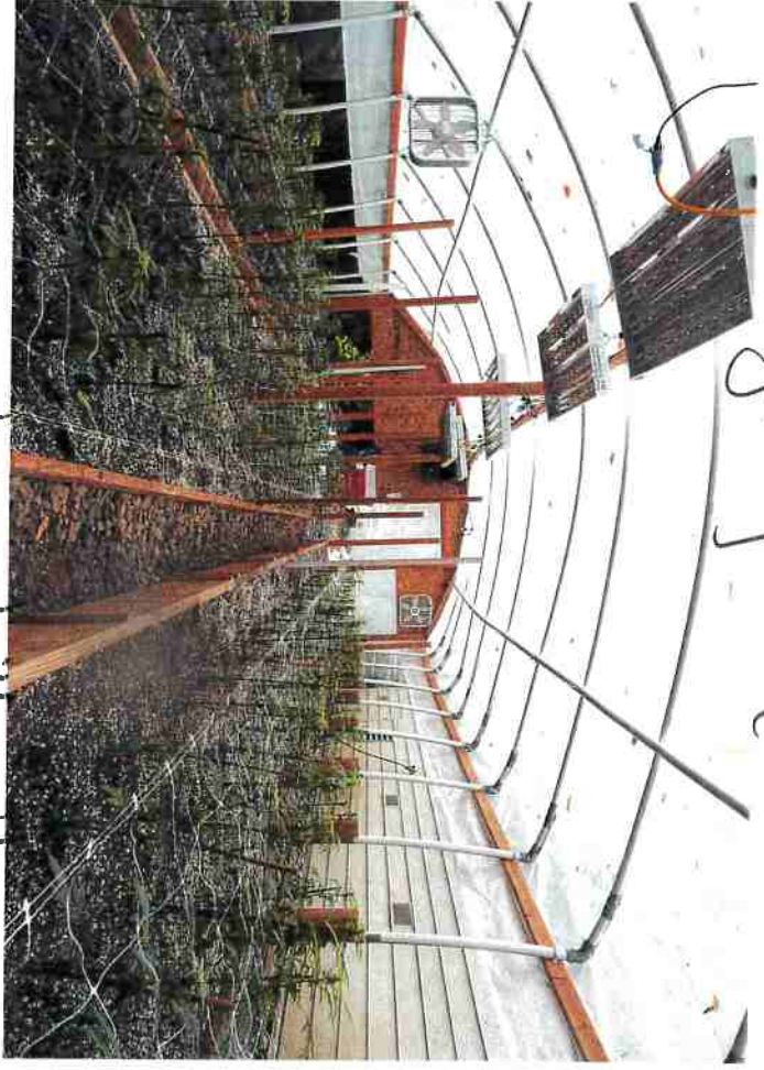
mouse mill site