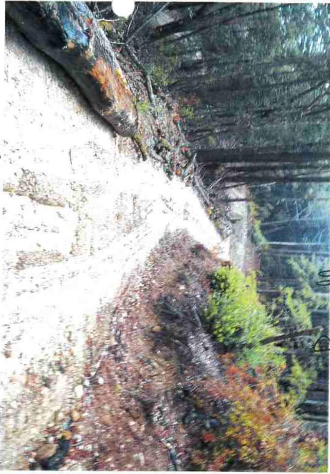
road to upper grow