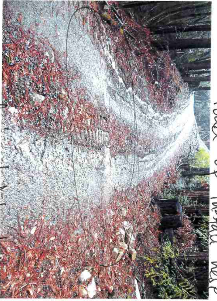
road up culvert to install here