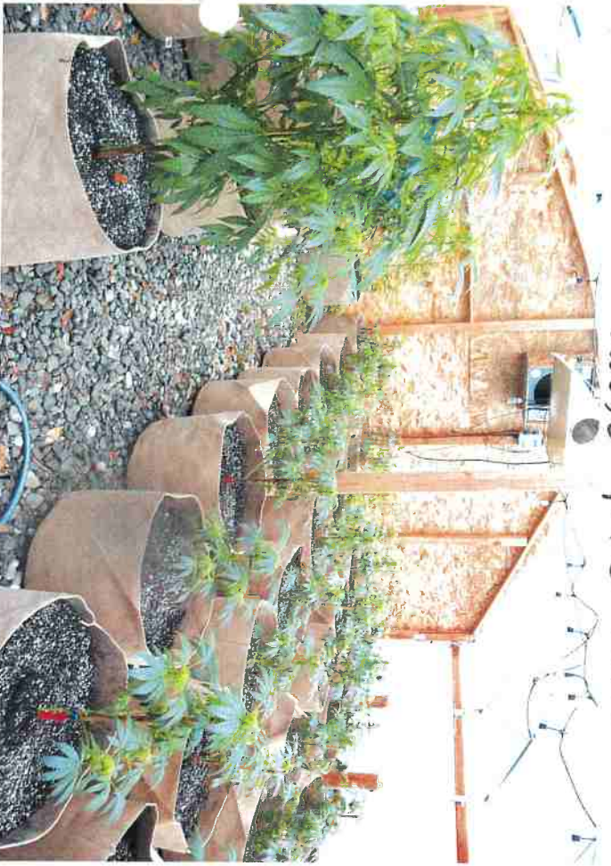
mouse site int.