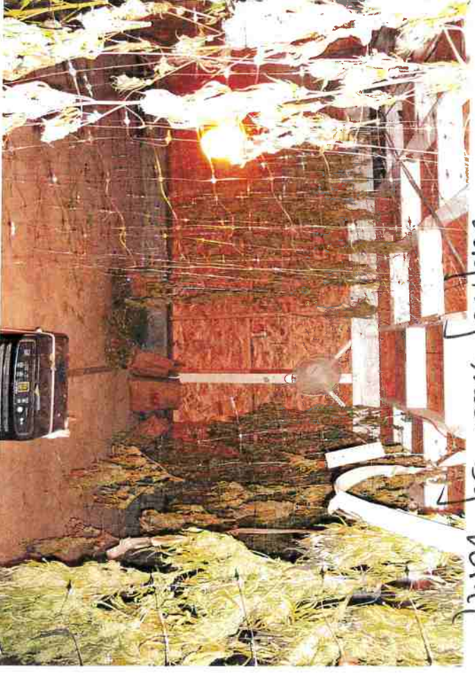
digging shed by home