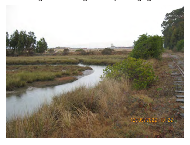
Tidal channels in segments 3 and 4 have shifted significantly (example above).