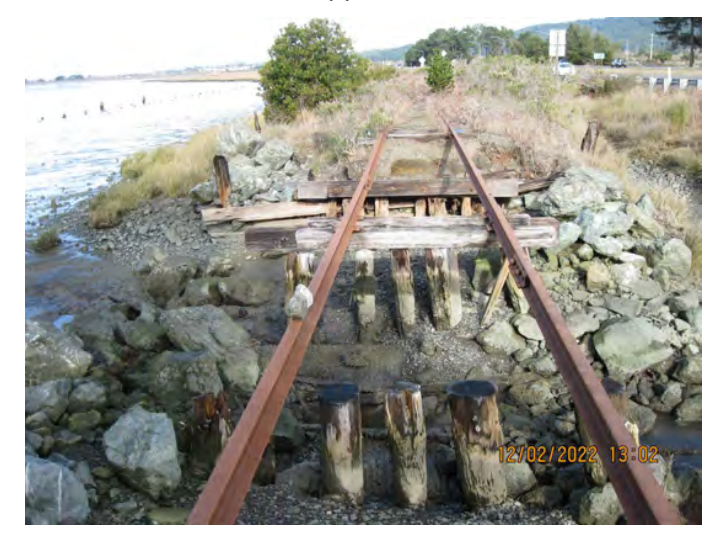
Railroad ties will need to be replaced in locations (example above) along the project alignment.