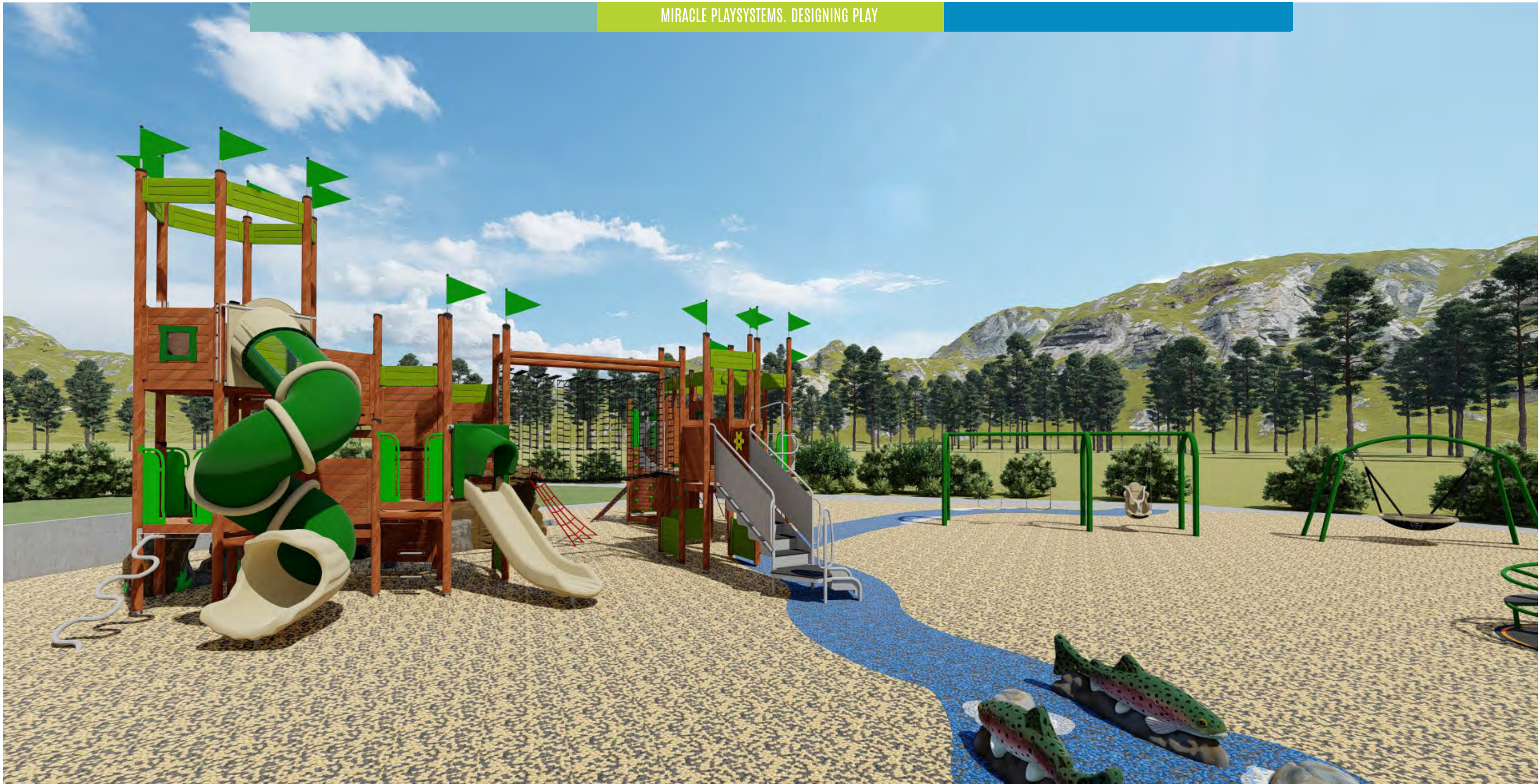
5-12 Play Yard

*Colors shown in rendering are for illustrative purposes only. Actual color and pattern may vary slightly.