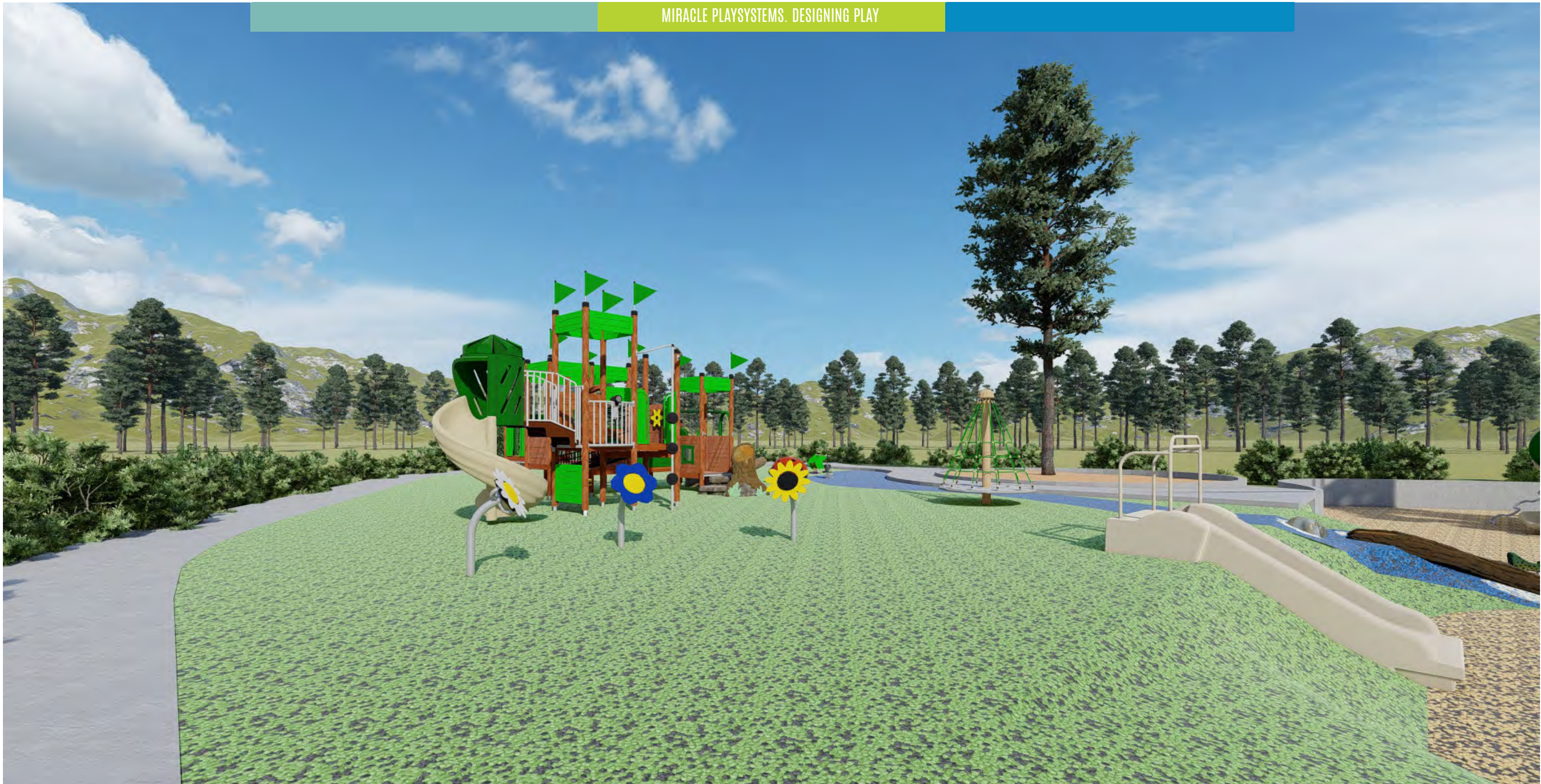
2-5 Play Yard

*Colors shown in rendering are for illustrative purposes only. Actual color and pattern may vary slightly.