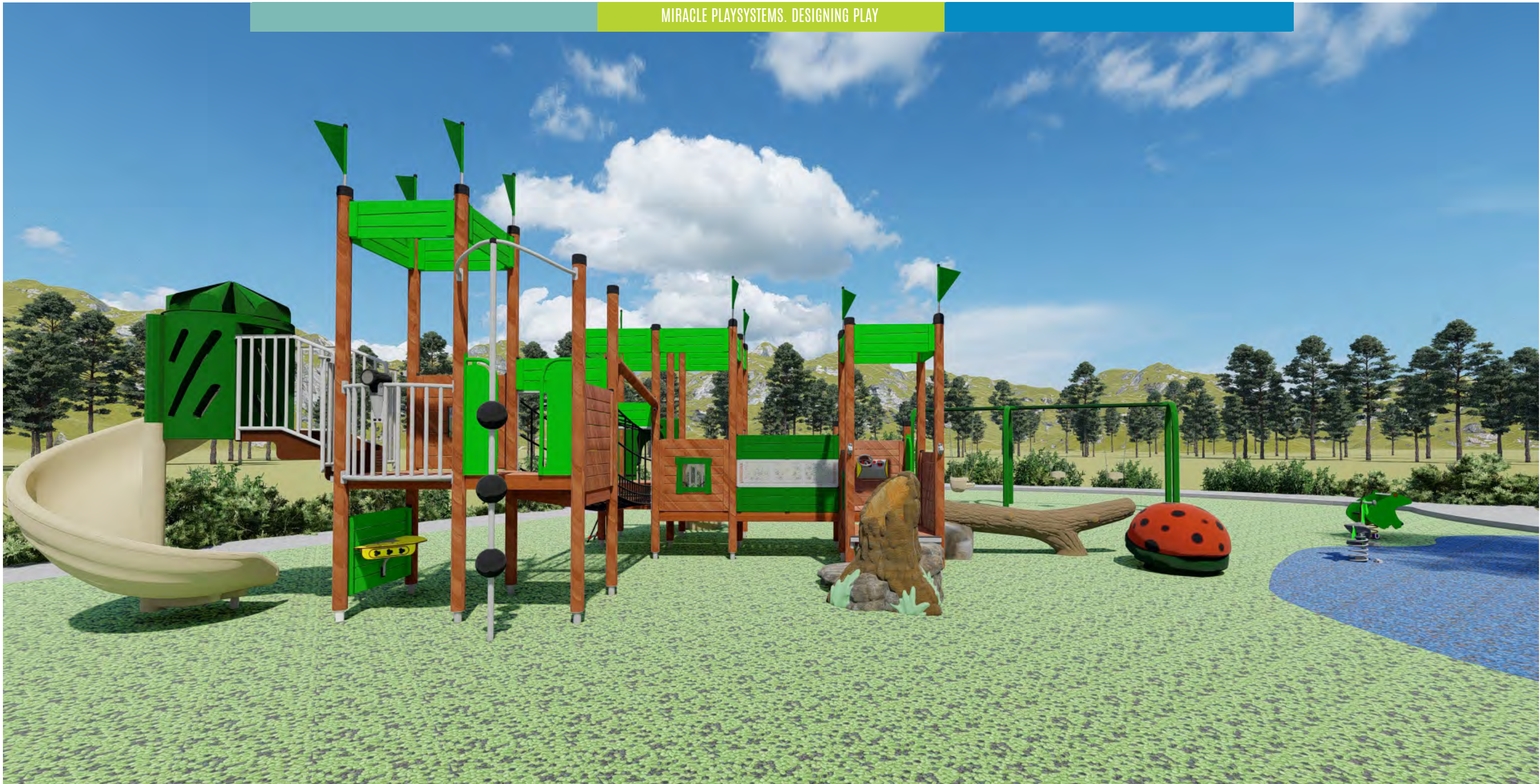
2-5 Play Yard

*Colors shown in rendering are for illustrative purposes only. Actual color and pattern may vary slightly.