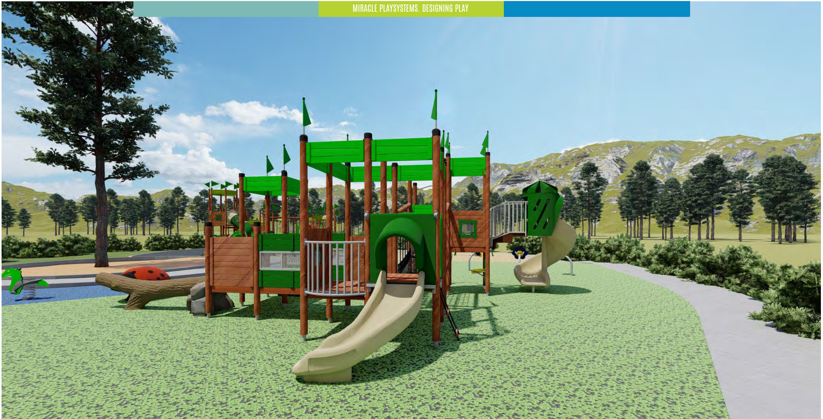
2-5 Play Yard

*Colors shown in rendering are for illustrative purposes only. Actual color and pattern may vary slightly.