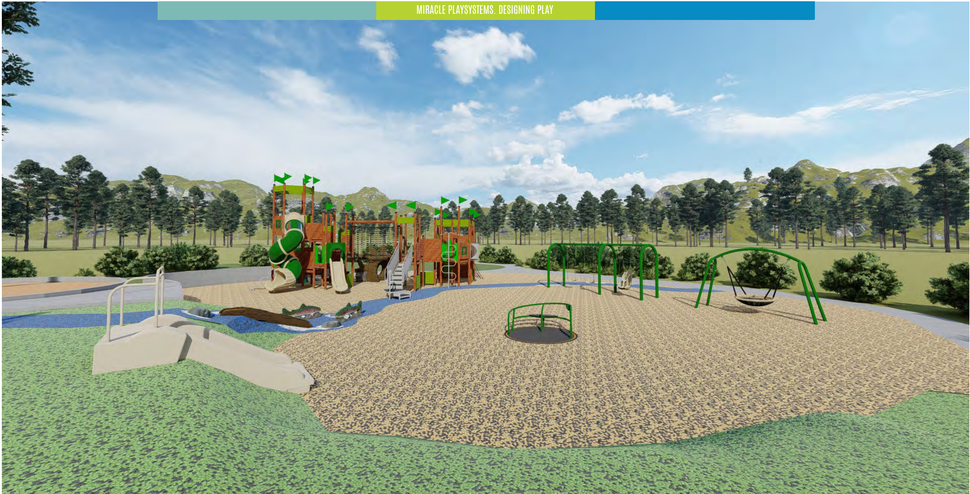
5-12 Play Yard

*Colors shown in rendering are for illustrative purposes only. Actual color and pattern may vary slightly.