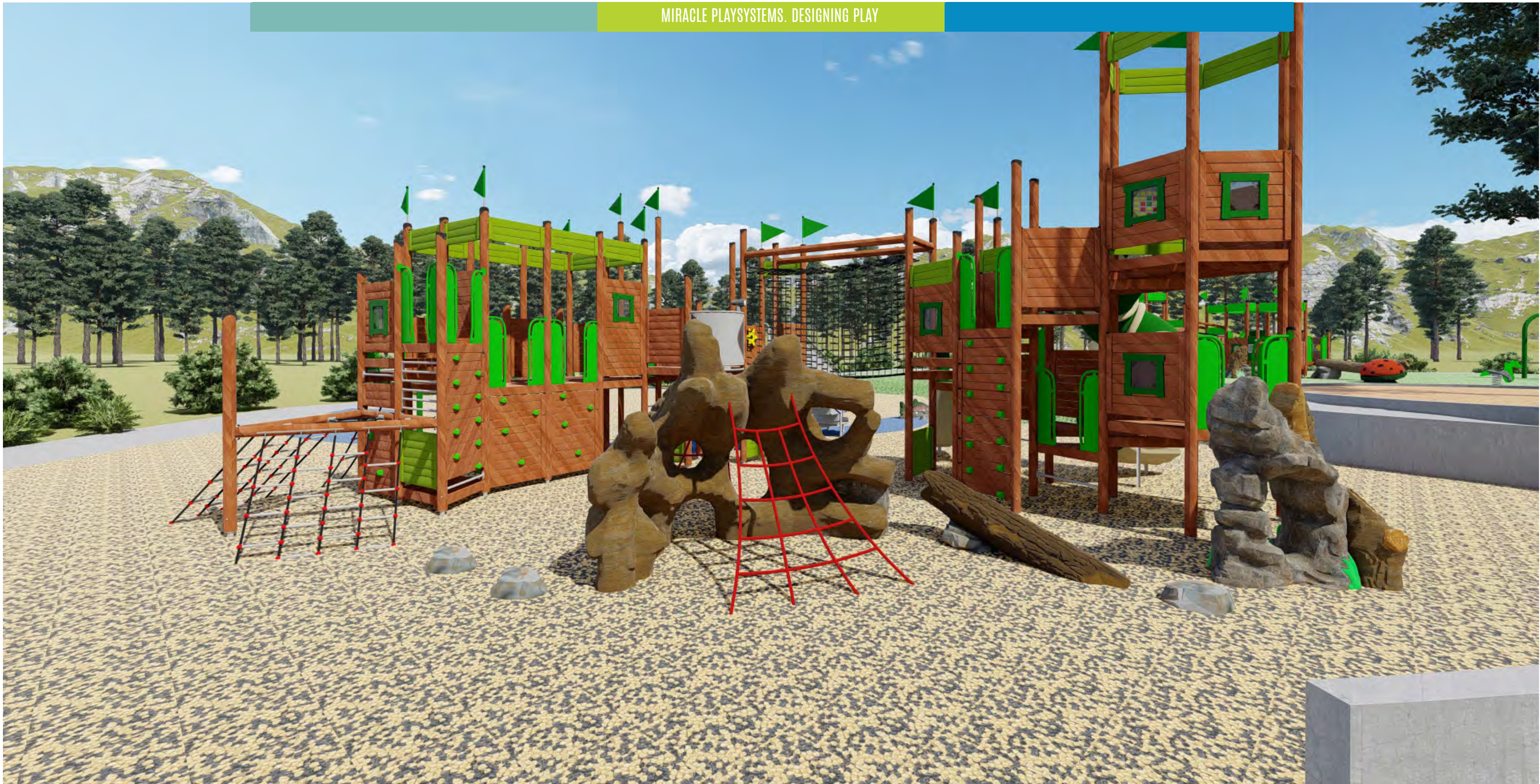
5-12 Play Yard

*Colors shown in rendering are for illustrative purposes only. Actual color and pattern may vary slightly.