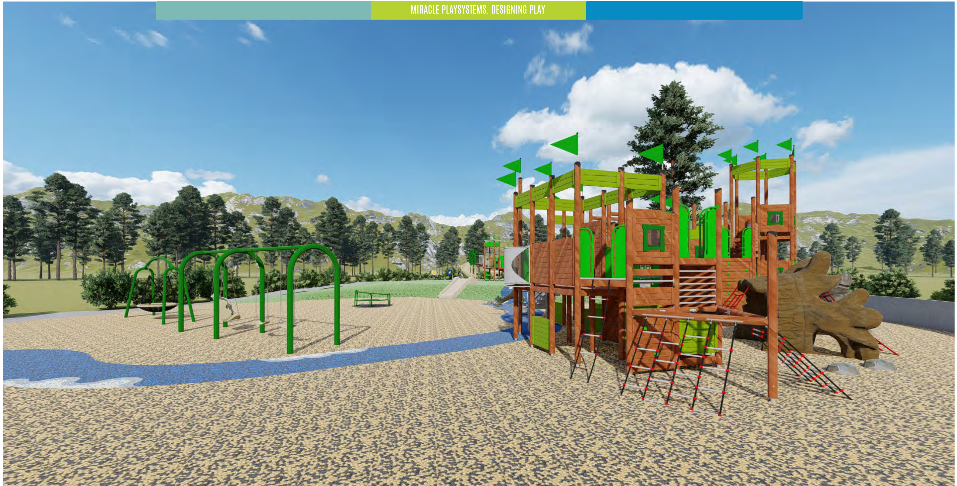
5-12 Play Yard

*Colors shown in rendering are for illustrative purposes only. Actual color and pattern may vary slightly.