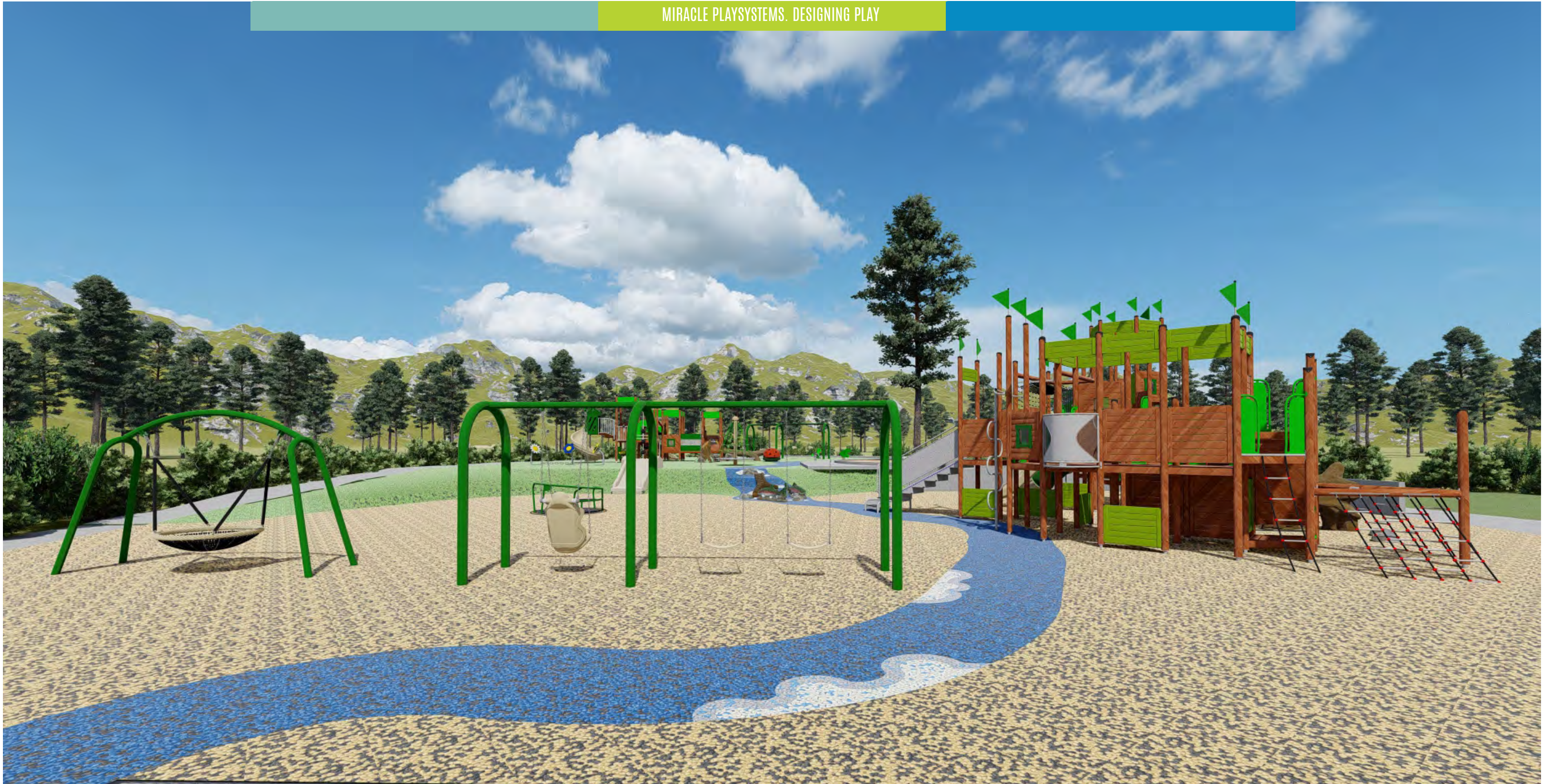
5-12 Play Yard

*Colors shown in rendering are for illustrative purposes only. Actual color and pattern may vary slightly.