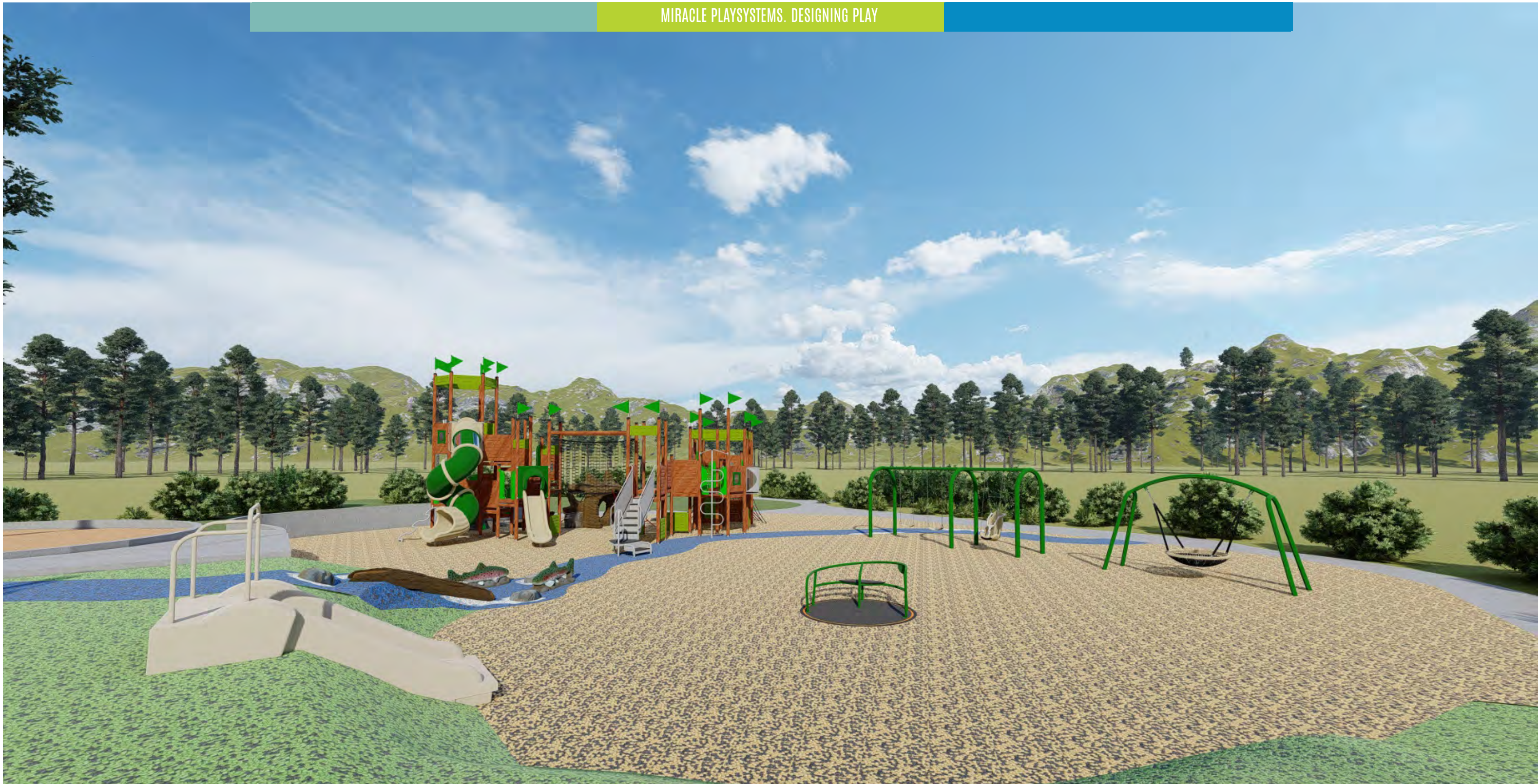
5-12 Play Yard

*Colors shown in rendering are for illustrative purposes only. Actual color and pattern may vary slightly.