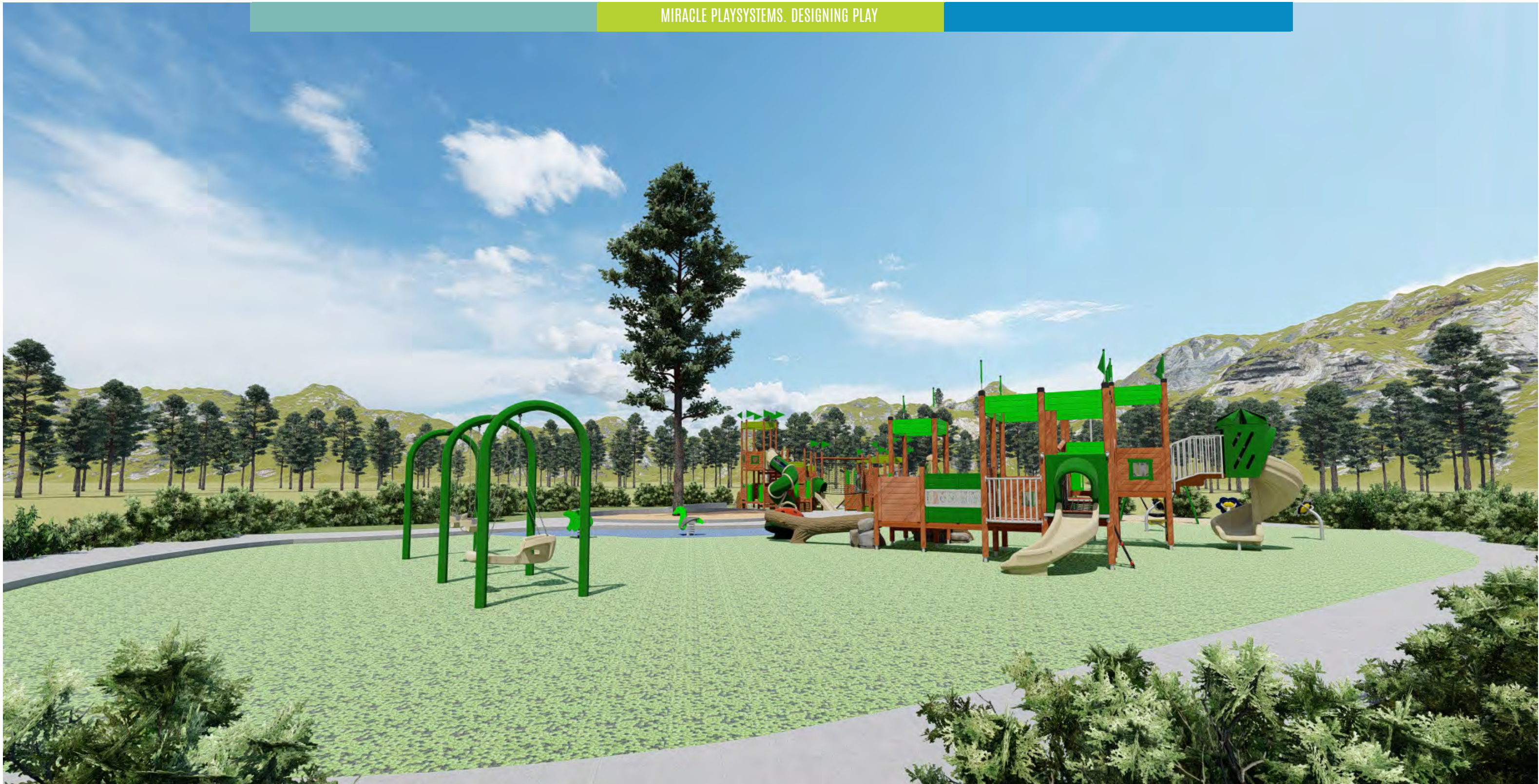
2-5 Play Yard

*Colors shown in rendering are for illustrative purposes only. Actual color and pattern may vary slightly.