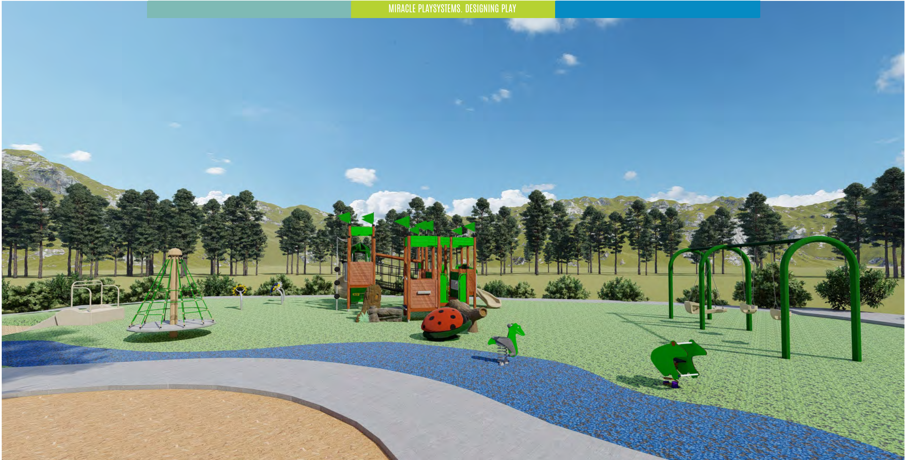
2-5 Play Yard

*Colors shown in rendering are for illustrative purposes only. Actual color and pattern may vary slightly.