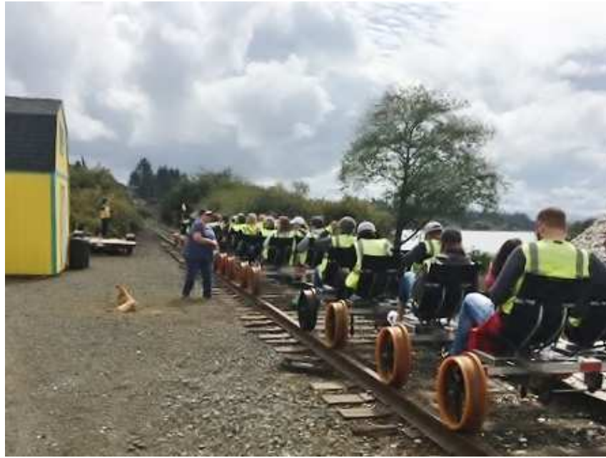
Oregon Coast Rail Rider staging in Tillamook Oregon