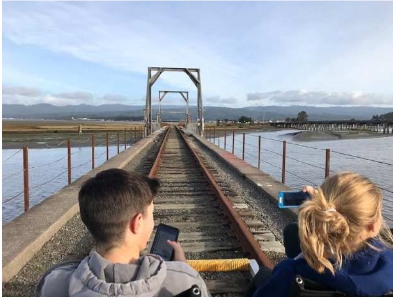
The view over Eureka Slough