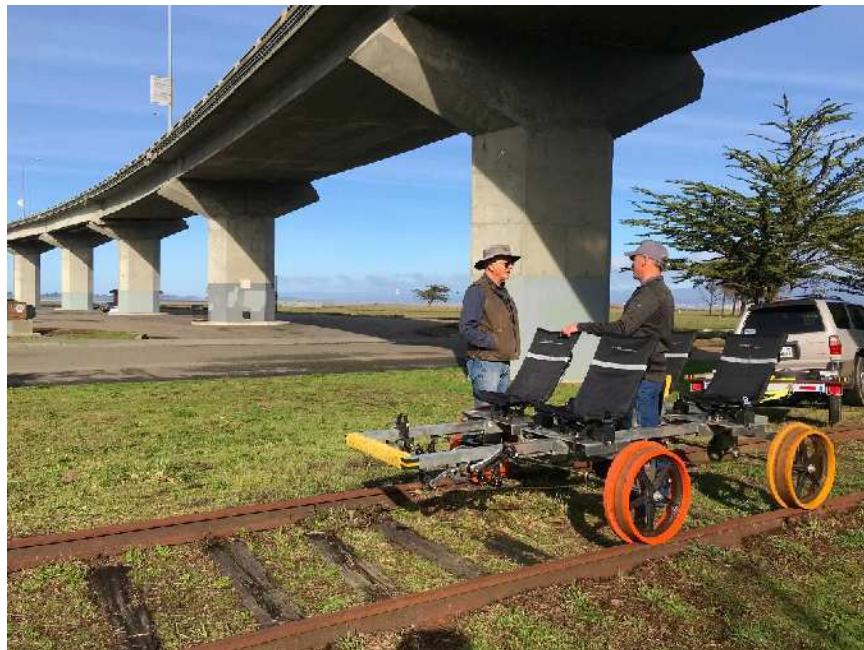
Section of rail line at Halvorson Park Eureka